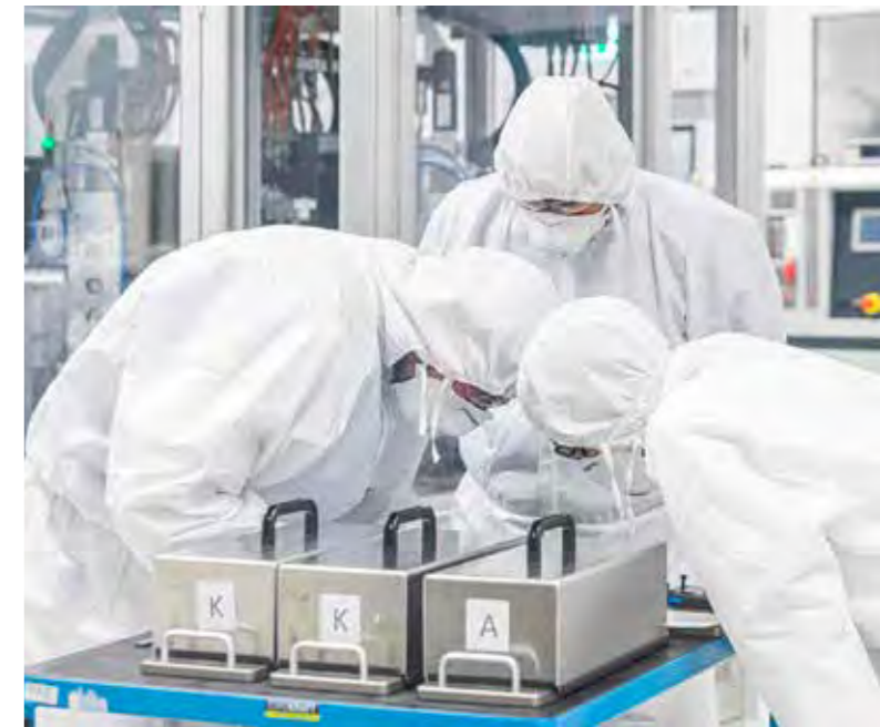
Technicians inspect battery cells from the pilot production

But a conventional battery plant would not be ambitious enough for the world's largest car producer. Ultimately, electric mobility is only beneficial for the environment when the production of the required power and batteries is climate-neutral, and this is exactly the area of expertise of VW's Swedish partner Northvolt, which produces the batteries