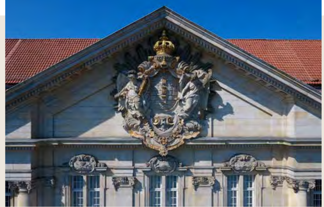
The Berlin Kammergericht became a celebrated symbol of the rule of law across Germany