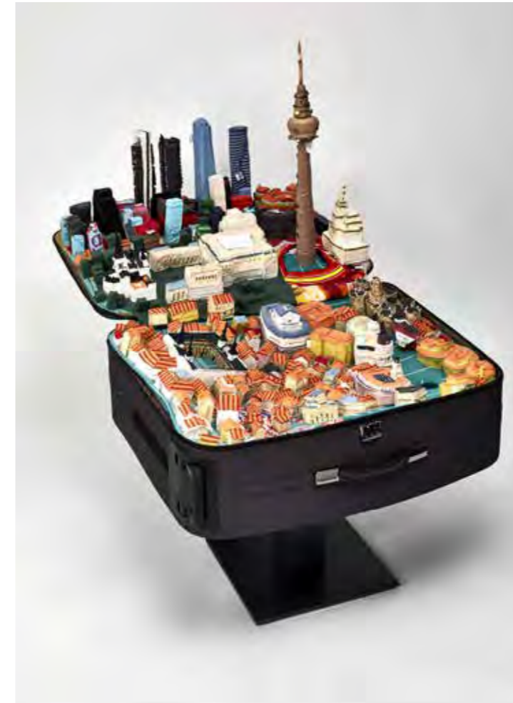
Yin Xiuzhen, Portable City: Madrid (2012); suitcase, used clothes, sound installation; 100 x 151 x 87 cm