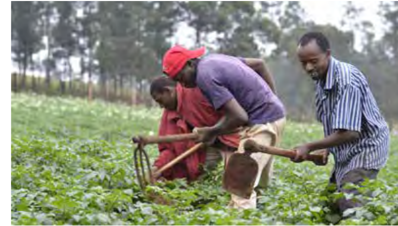
Each procurement procedure is unique due to the special requirements of the respective country of deployment

At times, tension between different ethnic groups and cultural traditions naturally have to be taken into