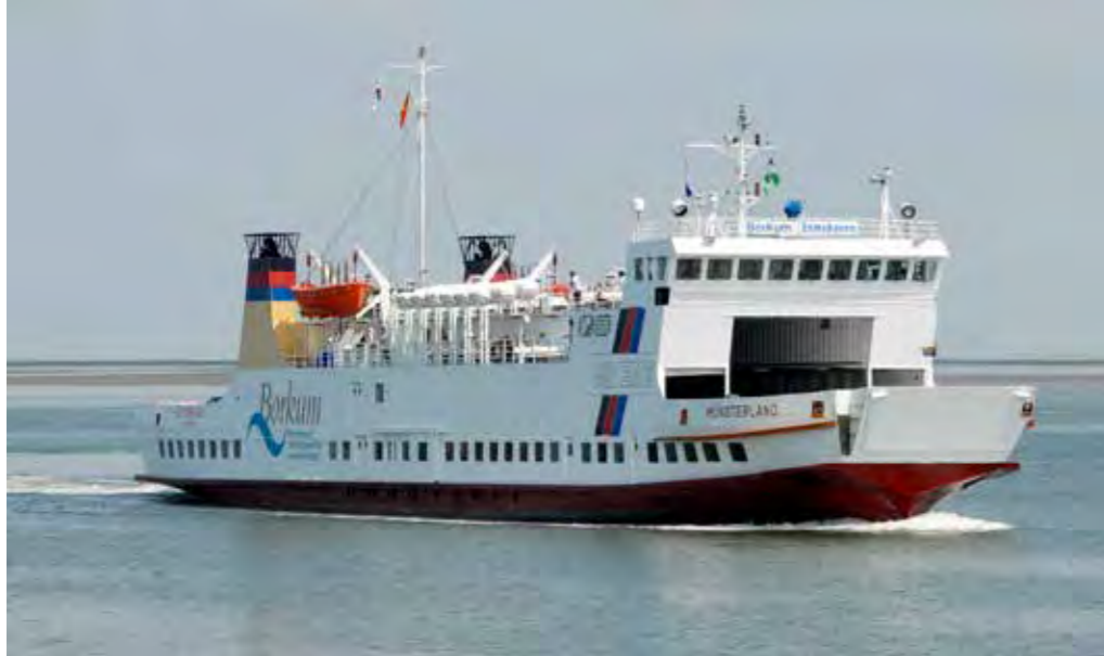
The MS Münsterland will resume its ferry services in 2021