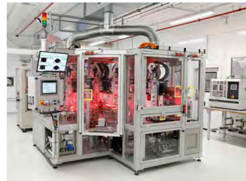
An automatic handling machine stacks electrode sheets