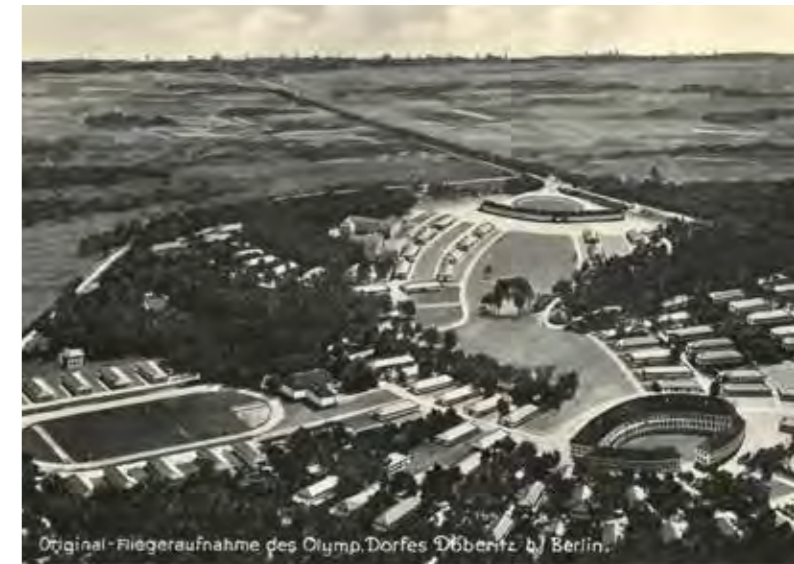
The Olympic village was built for the Olympic Games in 1936

people. The implementation of this plan is surely one of the most prestigious housing projects in Germany. In the meantime, the first development plan has come into force. The construction measures are in full swing and a second development plan is in preparation.