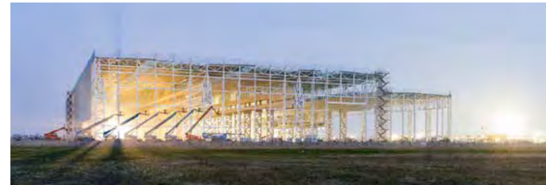
The production hall and all the auxiliary buildings had to be ready for production in only 10 months

The Siemens Group has high ambitions for off-shore wind power. Cuxhaven, on the North Sea shore, is a major location for the off-shore wind industry. The Siemens group had plans since 2017 to build nacelles with a length of approx. 15 m and a diameter of approx. 6.5 m with a weight of 200 tonnes (so-called D7 platform) for off-shore wind turbines. A working group was commissioned to construct a production hall including all auxiliary buildings. The working group partners are the Heitkamp Ingenieur- und Kraftwerksbau and the Ballast Nedam Infra B.V., who instructed Leinemann Partner as their legal advisors. The wind turbines produced in future by the facility will provide up to 7 megawatts and produce up to 32 million kWh of electrical energy per year. The production hall is just as enormous as the nacelles and, without the auxiliary buildings, has a floor area of approx. 332 x 156 m and a height of more than 30 m.