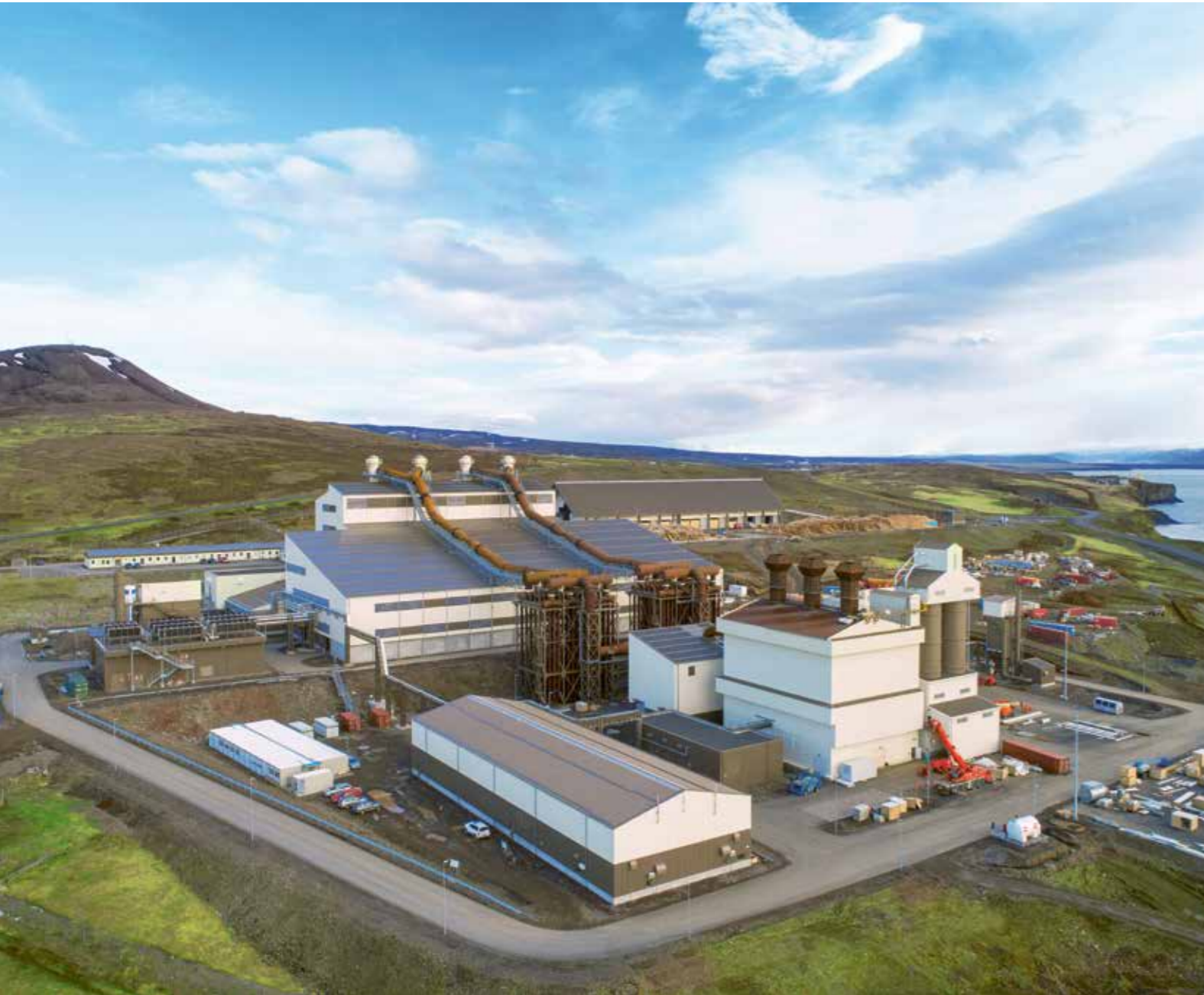
PCC SE has invested approx. 265 million euros in the plant

The location of Húsavík («cove with houses») with its 2,200 inhabitants may only be known to some Iceland insiders in Germany. Yet now, one of the most modern and environmentally friendly silicon metal production plants in the world has been built at this picturesque fishing town, with legal support from Leinemann Partner. The plant which will be important for the supply of raw materials to Germany entered into service in 2018.