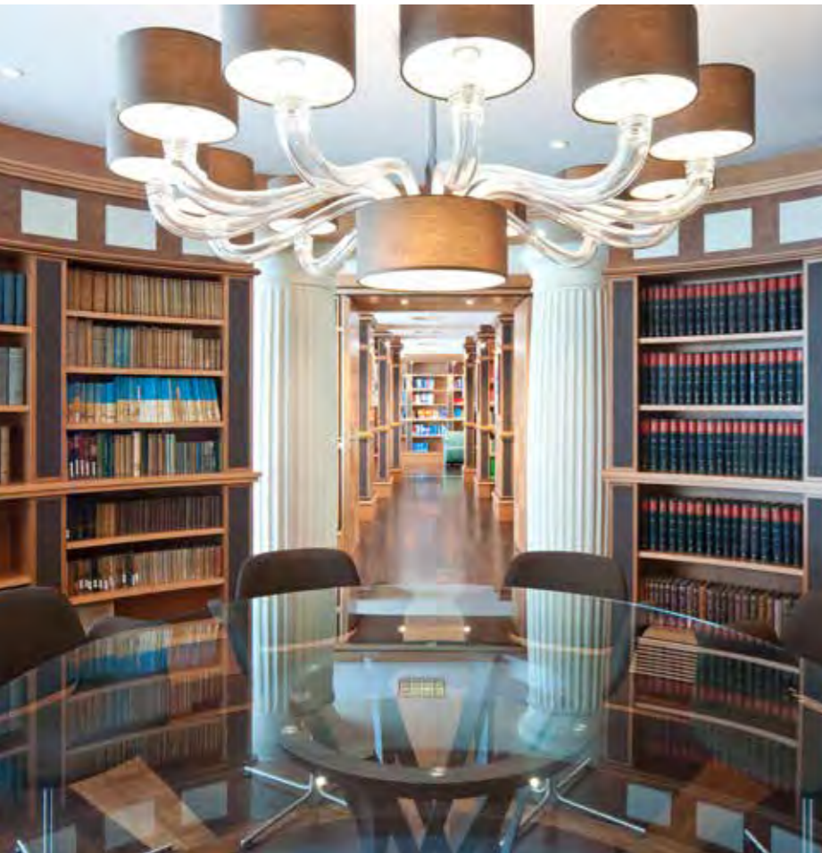
Leinemann library in Berlin: a perfect place to conclude a contract