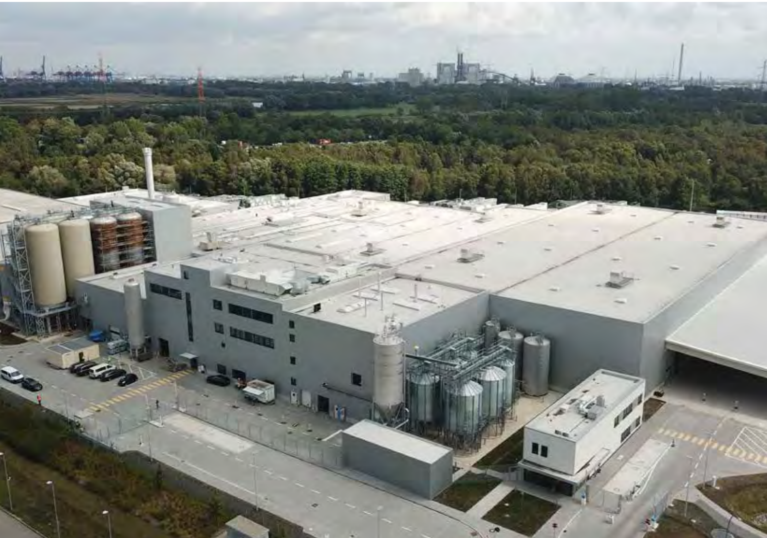
The new large facility with approx. 55,000 m 2 is producing roughly a million hectolitres of beer per year

Leinemann Partner advised the Carlsberg Group during the construction of the new Holsten brewery in Hamburg