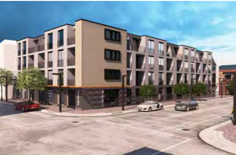
Prefab elements can be used to erect entire building complexes