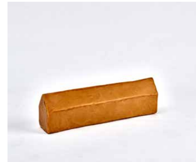
Wolfgang Laib, Haus (1990), bees wax, 20 x 13 x 65 cm