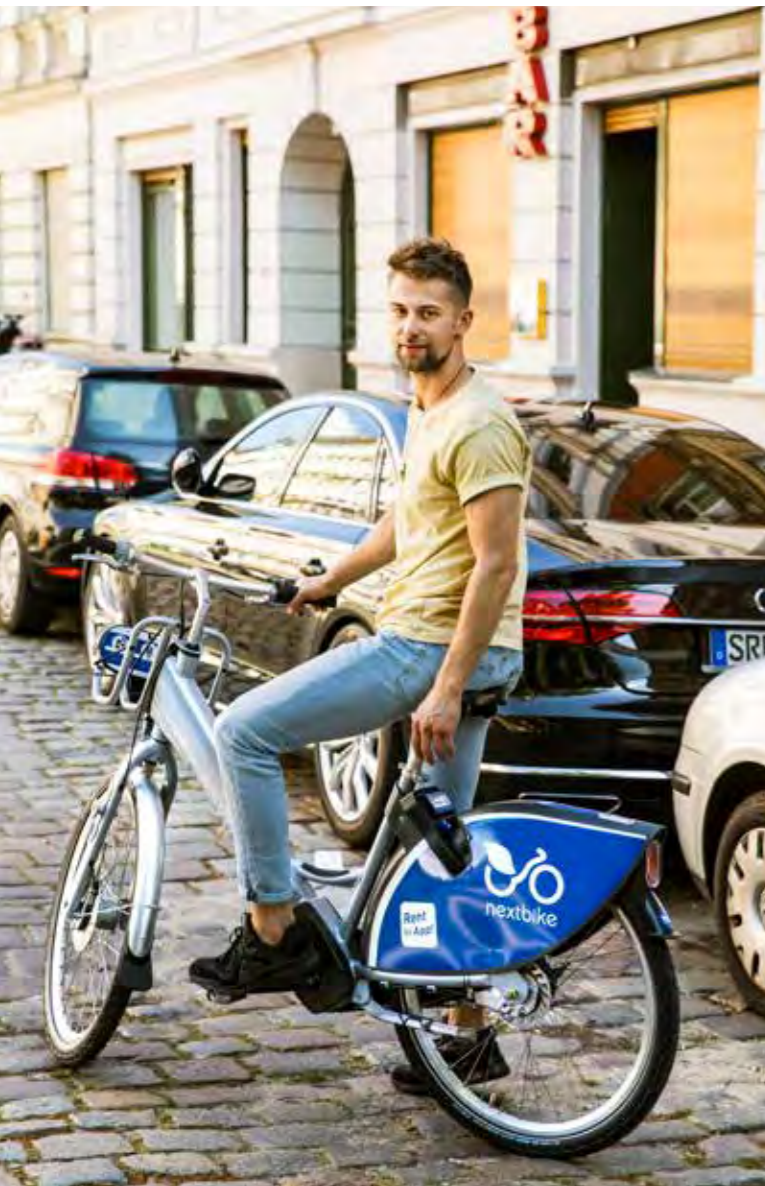
Nextbike was awarded the tender for the bicycle rental system in Berlin with Leinemann support against strong competition

In recent years, the market for public bicycle rental systems has grown significantly. As an additional service provided by the public transport network, a bicycle rental system is a practical solution which helps meet the