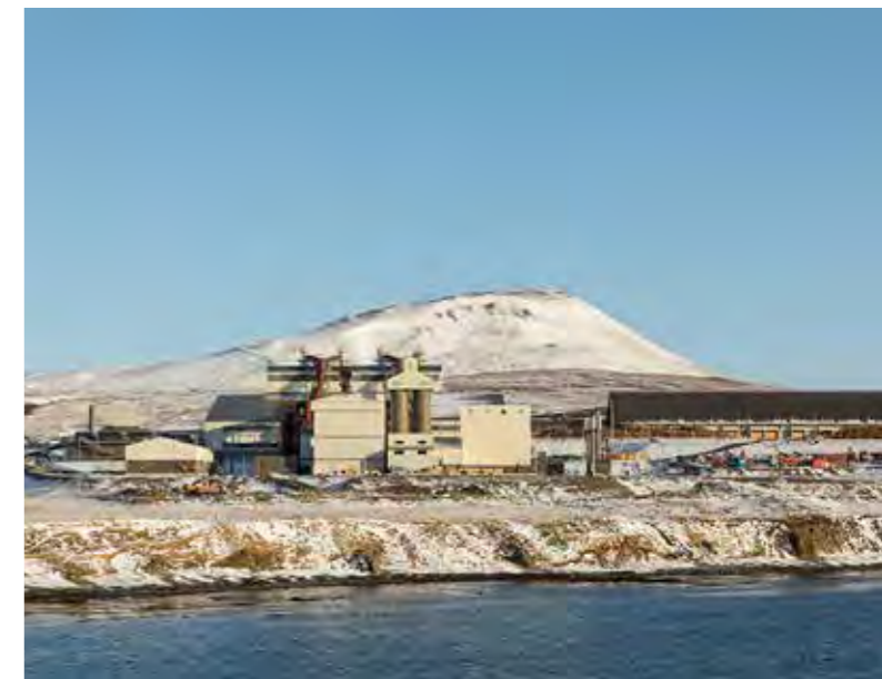
Almost all of the power requirements in Iceland are covered by renewable energy sources