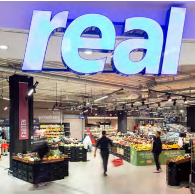
A large-scale investment programme is planned for the restructuring of real estate

For two years the German Metro AG company was in search of a buyer for its Real supermarkets which had developed to become a loss-making subsidiary. After a long bidding contest, the bidder SCP Group was successful, supported by its German partner x+bricks who are a leading investor in food-anchored real estate.