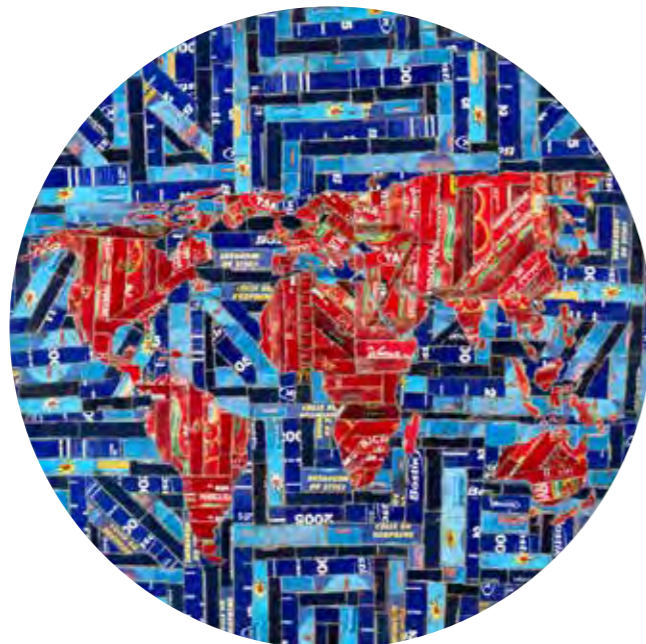
Adel Abdessemed: Mappemonde (2013) used sheet steel, painted, diameter 172cm