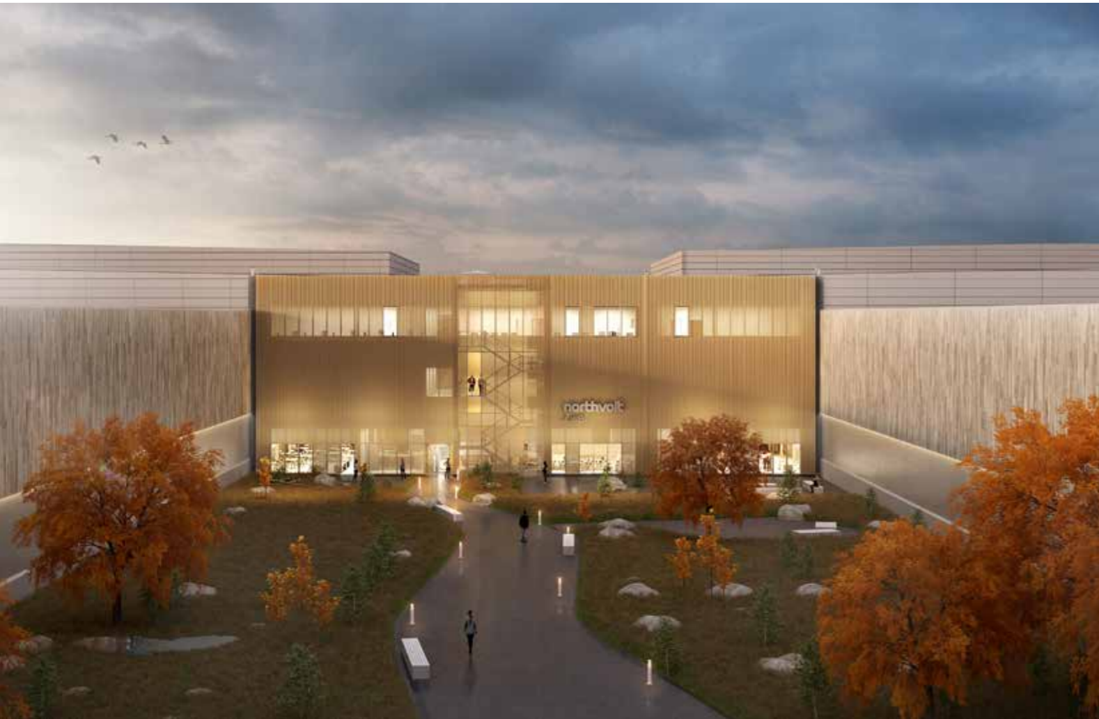
Volkswagen plans to sell 26 million electric vehicles by 2029

T he Volkswagen Group has aligned its company strategy to fully commit to electric mobility. Over the next nine years, up to 75 new pure electric models will be introduced together with around 60 hybrid vehicles. All in all, Volkswagen plans to sell 26 million electric vehicles by 2029. To achieve this target, the company management in Wolfsburg has earmarked roughly 33 billion euros for an enormous investment programme to catapult the world's largest car producer, and, at the same time Germany's largest industrial group, into a leading position in the electric mobility market.