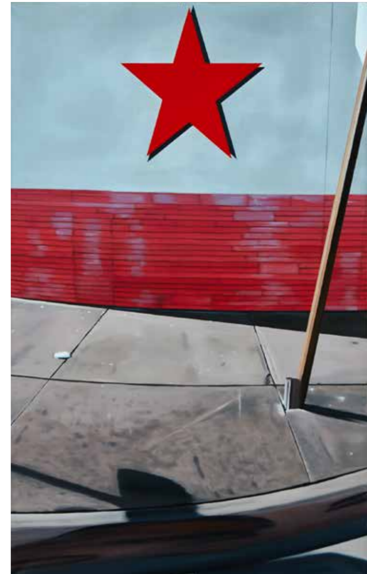
Eberhard Havekost, MIAMI (2007), oil on canvas, 171 x 106 cm